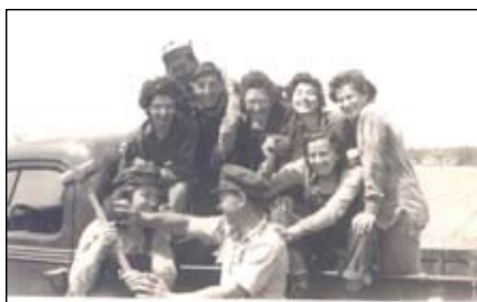
Youth on Hechalutz farm, 1946.

On view were photographs of family farms and various Jewish agriculture training schools stretching from northern Ontario to the Niagara Peninsula, accompanied by stories of individuals and groups that thwarted Canada's strict immigration policies