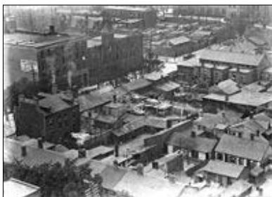
The Ward, 1910.

the membership of Toronto's Society doctors along with the outpatient services of Toronto's General and Sick Children's Hospitals, which provided the medical needs of Toronto's Jewish community. This capitation scheme witnessed critical and demanding patients who looked down on their Society doctors, who were in fact their progeny. Aware of their tenuous status in medical society, Society patients would occasionally demand specialist care. I was personally witness to this as a febrile eight-year-old whose Society doctors' reassurance was ignored by parents but duplicated by an elevated non-Jewish pediatrician whose fee was