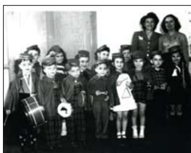
Calgary Hebrew School Kindergarten Band, c. 1947

Members of the Calgary Jewish community were thrilled to be part the 40th anniversary celebration at the May 29 Community Day during the 2016 ACJS Conference. Local participants were impressed by the breadth of information presented by