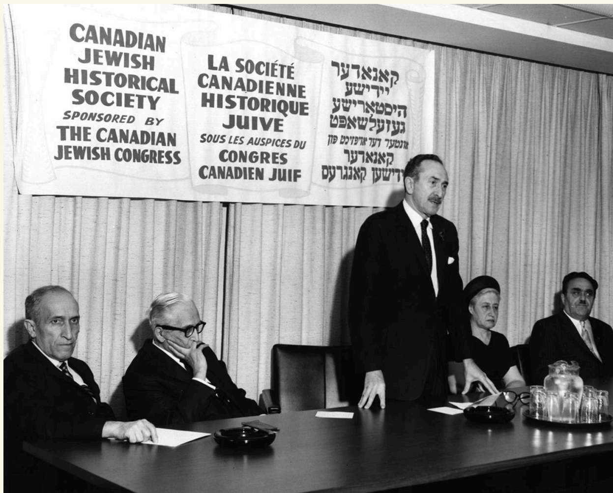
Canadian Jewish Historical Society panel, Montreal, 1967.