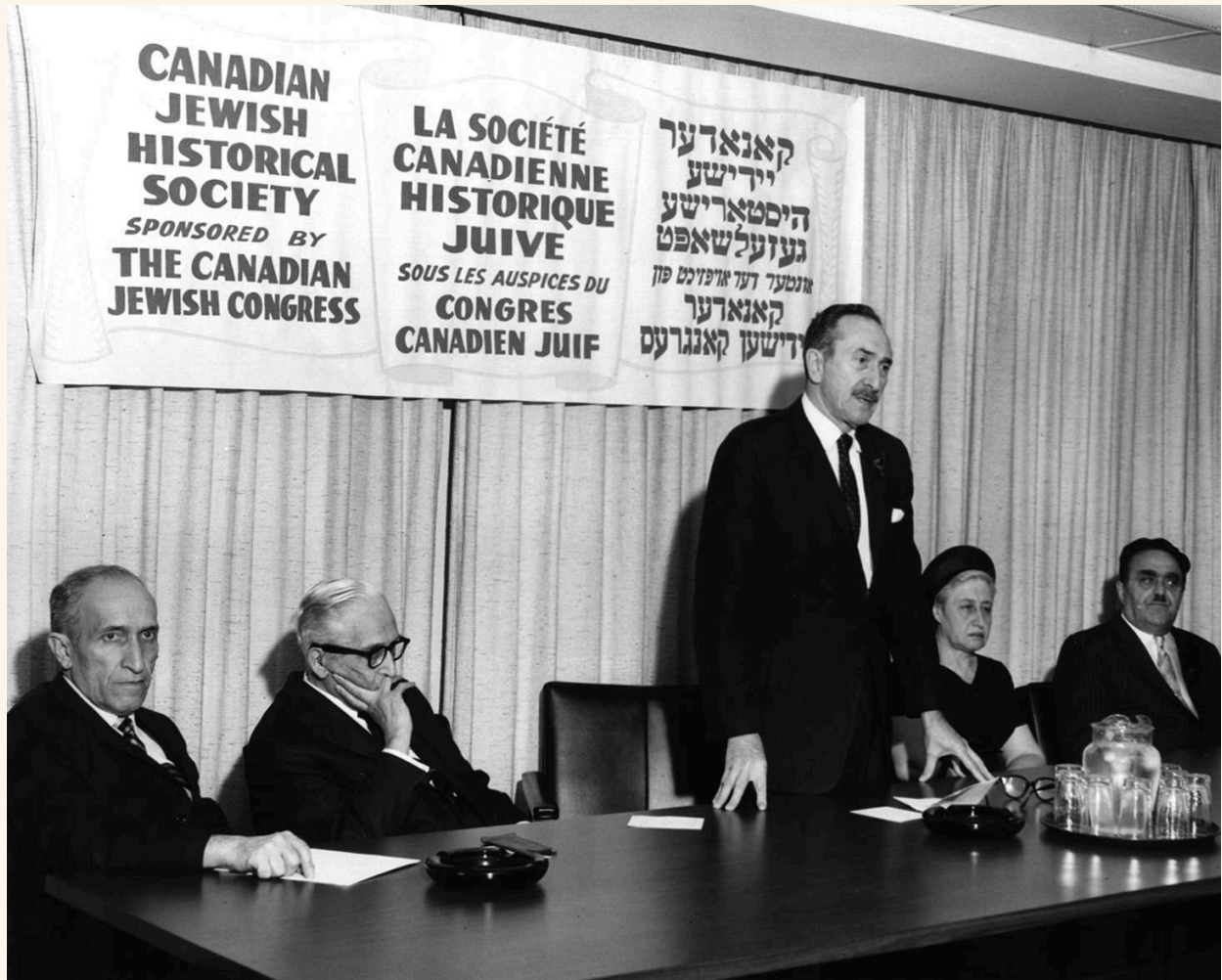
Canadian Jewish Historical Society panel, Montreal, 1967.