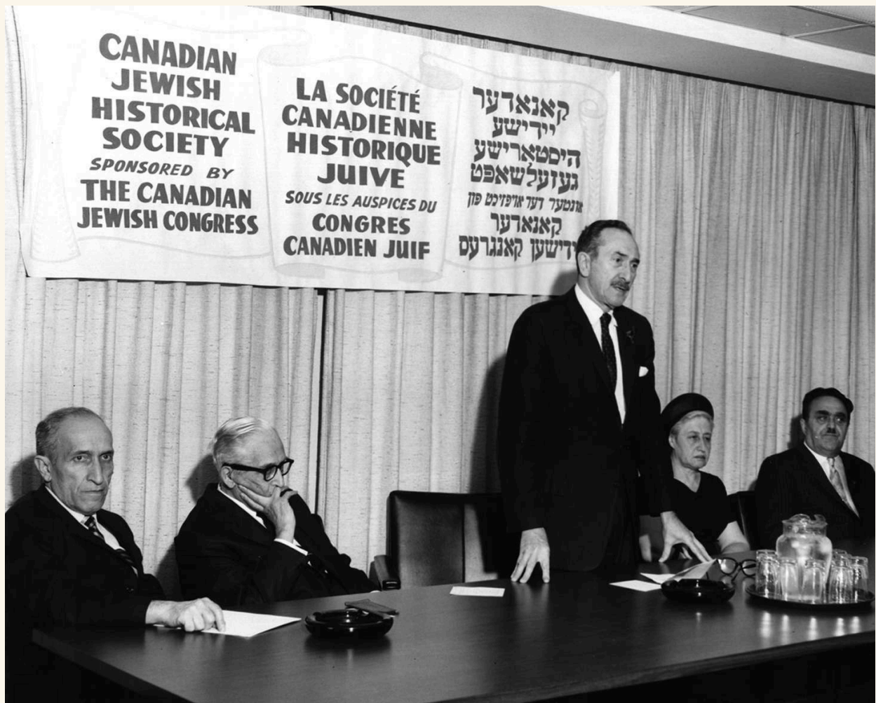
Canadian Jewish Historical Society panel, Montreal, 1967.